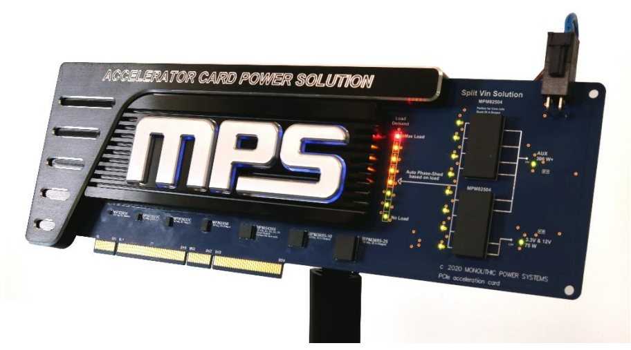
Figure 1: High-Current Power Module Accelerator Card

Accelerator cards are a rapidly expanding market driven by big data and the need for compression. transmission, and processing. They offer ultra-high data processing density in a convenient package. Current mass market solutions utilize a PCIe form factor, which is easier because it conforms to standard server architecture. However, the power solution can become a problem because of the limited available board space. Other accelerator card form factors are still extremely space-constrained to maximize processing density.