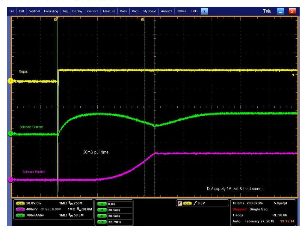
Figure 4: Simple Switch Waveforms

In our test, the motion, voltage, and current of the solenoid using a simple switch was measured (see Figure 4). In this case, the solenoid ( 15\Omega , rated for 12V) took 30ms to actuate and dissipated 10W of power whenever the solenoid was actuated.