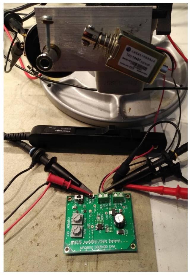
Figure 2: Test Set-Up