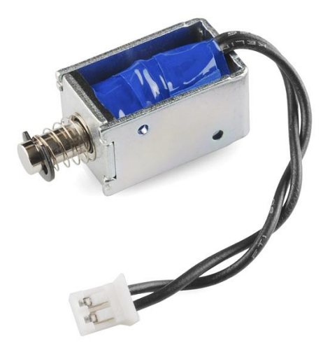
Figure 1: A Typical Solenoid

In its simplest form, a solenoid is a coil of wire that generates a magnetic field. The devices we usually refer to as solenoids are devices that use a coil of wire and a moving core made of iron or sometimes another magnetic material. Applying current to the coil causes the core to be pulled or pushed relative to the coil, causing motion that is used to actuate something in a mechanical system. A typical solenoid is shown in Figure 1.