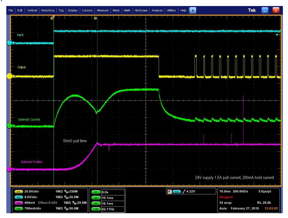
Figure 6: Reduced Hold Current Waveforms

The resulting drive waveforms are shown in Figure 6. The yellow trace is the OUT signal driving the solenoid, and the green trace is the solenoid current. Initially, the full supply voltage (24V in this case) is driven to pull in the solenoid. After a delay, the current is reduced by pulse-width modulating the output. The pull-in time is reduced to 16ms, and the holding power dissipation is much lower (around 600mW instead of 10W).